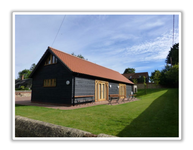
Parish council meetings are held at Dalham Village Hall every other month.

part of a county wide Community Governance Review being carried out by Suffolk, the location of the boundary between Ousden Parish Council and Dalham and Dunstall Green Parish Council is to be reviewed. As residents will be aware, the boundary is presently close to the southern end of Dunstall Green Road, close to Ousden, and the issue relates to whether it would be more appropriate for houses along Dunstall Green Road, currently forming part of the parish of Dalham and Dunstall Green, to become part of Ousden instead. Some 23 houses are affected by this review. The parish council will be seeking the views of those potentially affected prior providing its response.